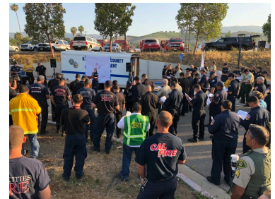
Goleta Fire 2018 CalCoast News

The Incident Command System is a highly standardized, top down, military based management for every agency or organization that responds to an event. This management tool is used to meet the demands of small and large emergency and non-emergency events. Come join us for a review of how this system works and reacquaint yourself with the position jobs and roles they play. There will be two class exercises for individual students to work on. This ICS instruction will be focused on CERT’s role in disasters and public events.